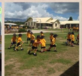
PHOTO A WEEK WINNER CATHOLIC SCHOOLS WEEK - KH