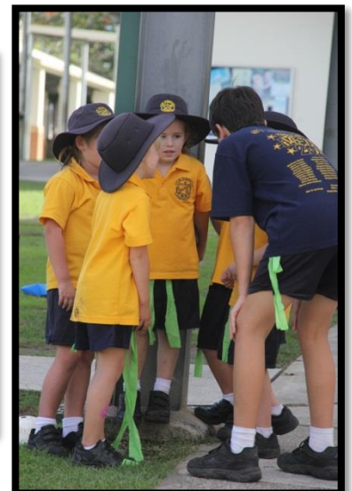
ST JOSEPH'S FEAST DAY SPORTS