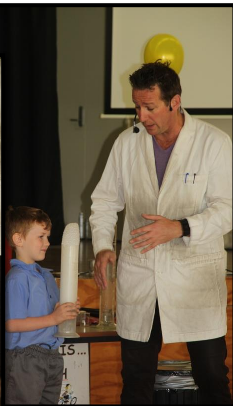
NAIDOC DAY CELEBRATIONS - 2015