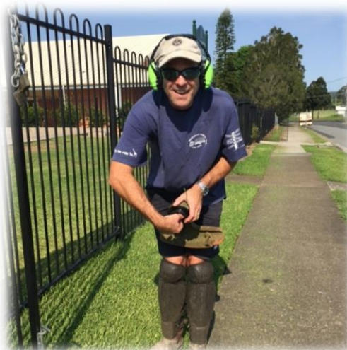
Last minute preparations and the stage is set!